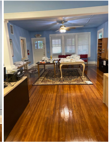
New Work Area