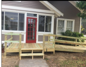
710 S Eucalyptus St