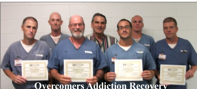
Overcomers Addiction Recovery