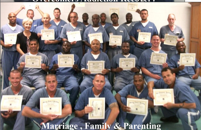
Marriage, Family & Parenting