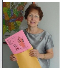
Our first Span- ish lesson in 2002.

Little Lambs Inc is a Not for Profit 501(c)(3) Corporation—All Gifts are Tax Deductible