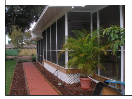
November 13, 2011 After Church 9:30 am to 4:00 pm 543 Magnolia Ave Sebring FL 338780